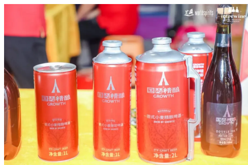
Trendy Drink Area